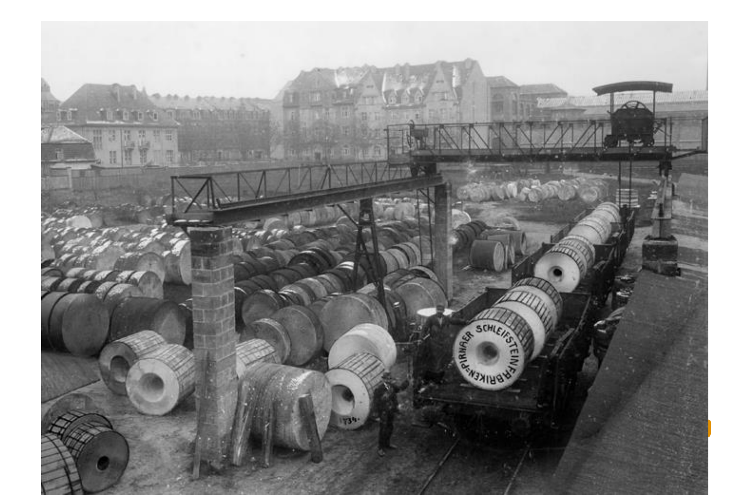
Wood grinders and millstones in the old factory in Pirna

Detail of a baroque sculpture, Park Sanssouci Potsdam