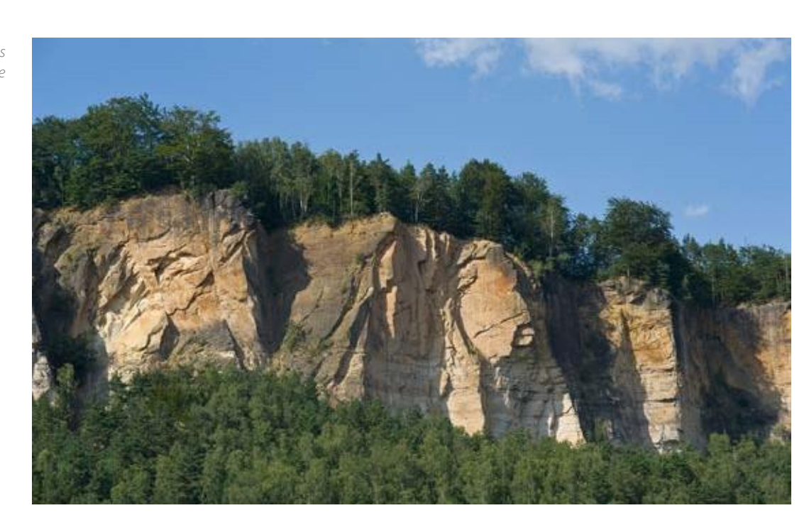
Historic quarries on the Elbe

but water, high and massive layers of sediment character. Formed in the Cretaceous period piled up over the course of time. These and cut through by the Elbe, the rocks there accumulations kept their world-famous shape rise idyllically and unmistakably from the forests due to the untameable forces of nature. of the Elbe Sandstone Mountains. Saxon