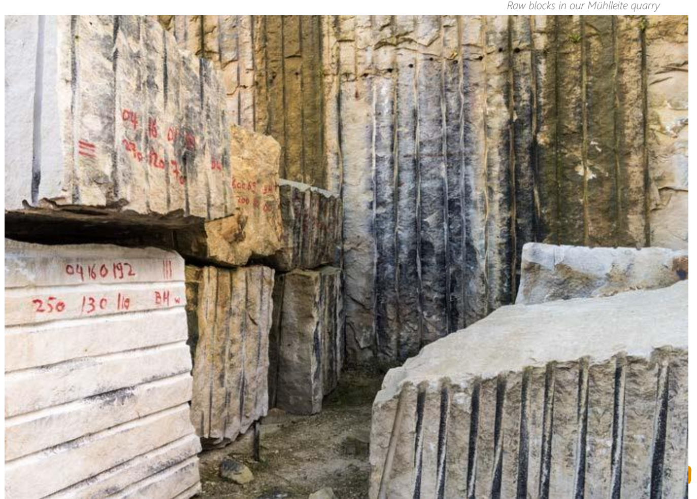
Raw blocks in our Mühlleite quarry